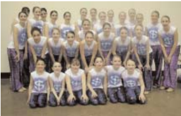
The Dance Etc. Dance Team at a previous competition